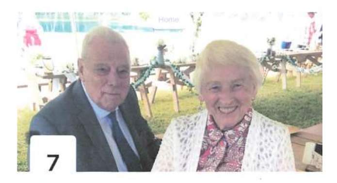
SATURDAY, MAY 7, 2022 AT 2 PM