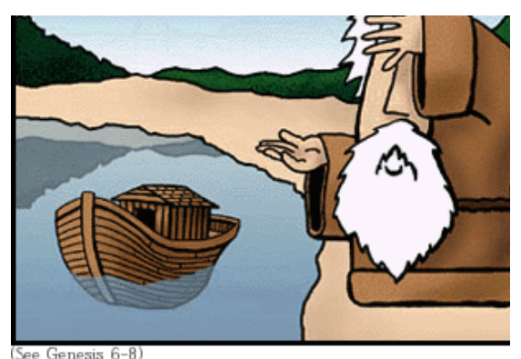
IT WAS ONLY AFTER NOAH FINISHED HIS ARI PROTOTYPE THAT HE FINALLY ADMITTED THAT HE DID NOT KNOW WHAT A CUBIT WAS