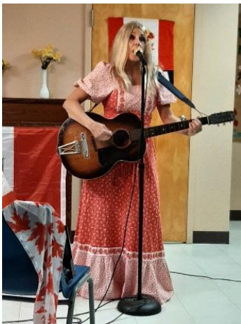
← "Joni Mitchell"