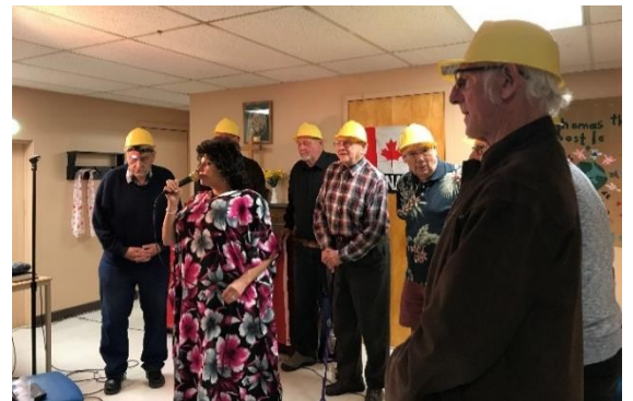
"Rita McNeil" with the miners' choir. →